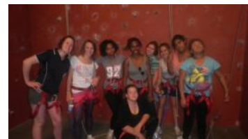
Indoor Rock Climbing