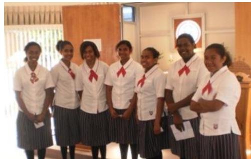
Our Boarders Choir at Salem Nursing Home

On Sunday May 8 on Mother's day, the boarding choir went to visit the Salem elderly nursing home. We performed and sang a song to entertain the residences, being there as the part of the group on that special occasion was a great experience, watching the smile on their faces made my day, the visit was worth it after all, celebrating Mother's day with the Salem residents was enjoyable.